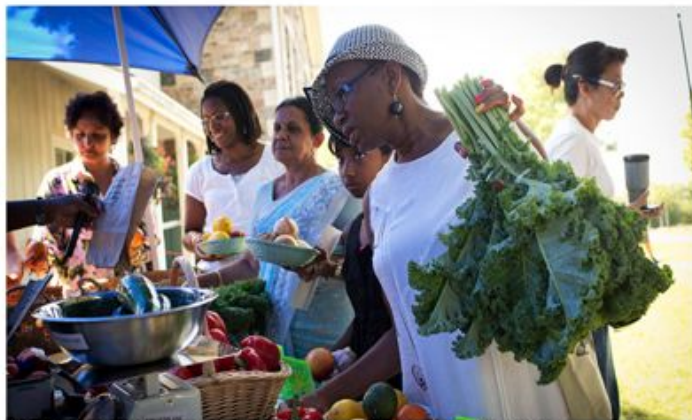
Green city: Food-systems planning covers everything from production to grocery-store locations